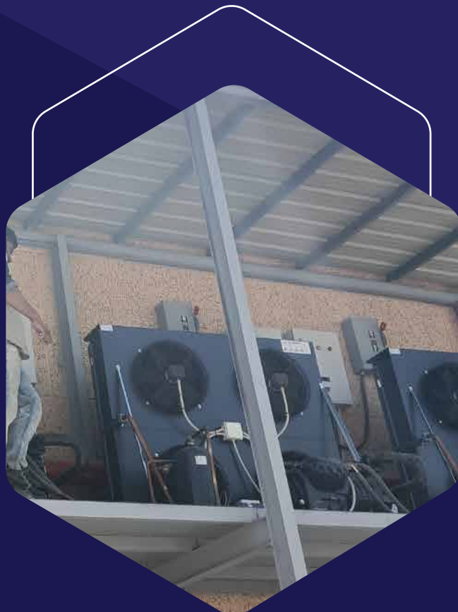
CONDENSOR & EVAPORATOR INSTALLATION