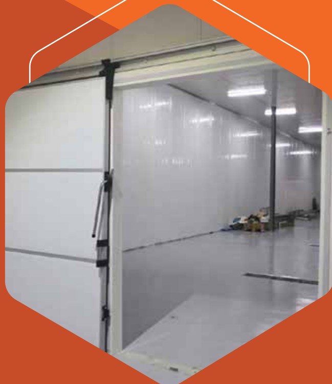
Refrigerated Cold Rooms ( Walk in Cold rooms) Hinged Doors