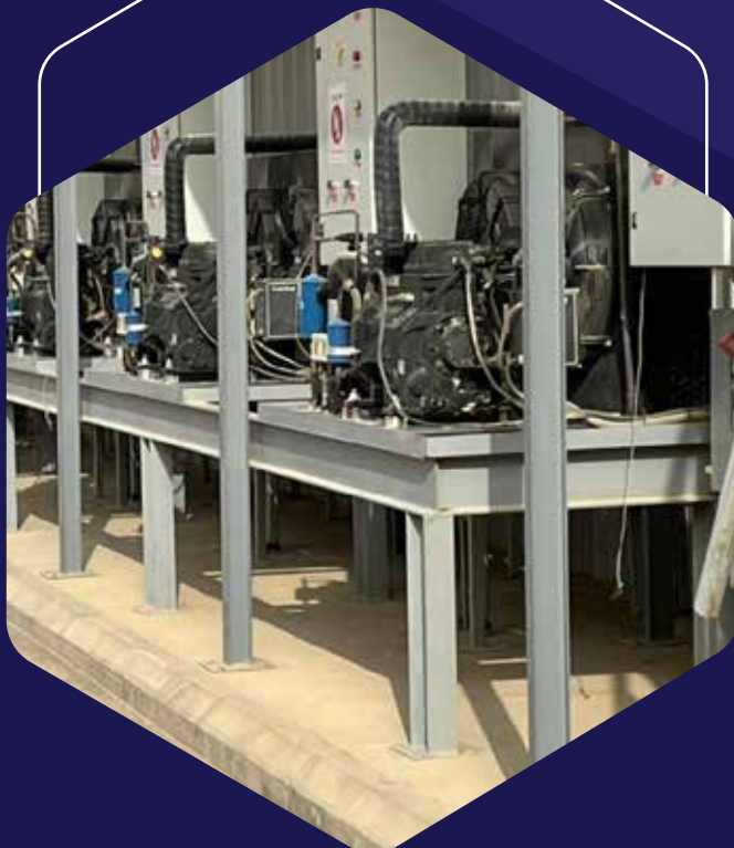
Ammonia Condensing Unit