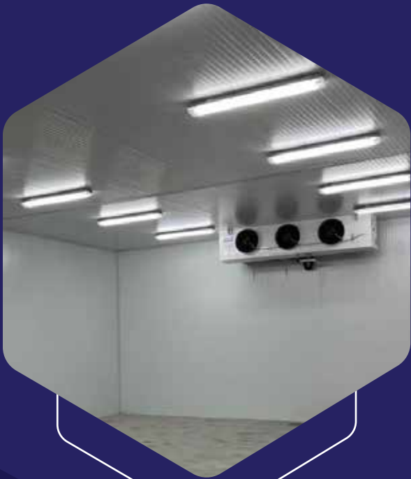
Cold Storage Lighting