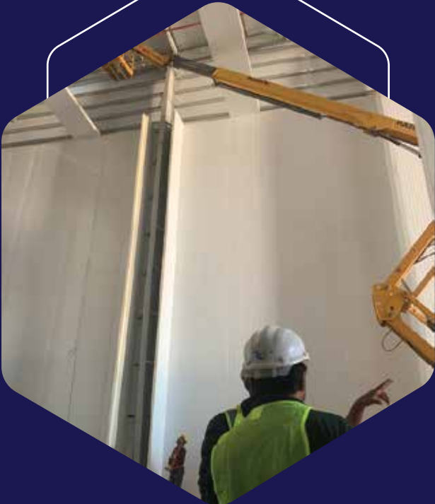
Sandwich Panel Erection