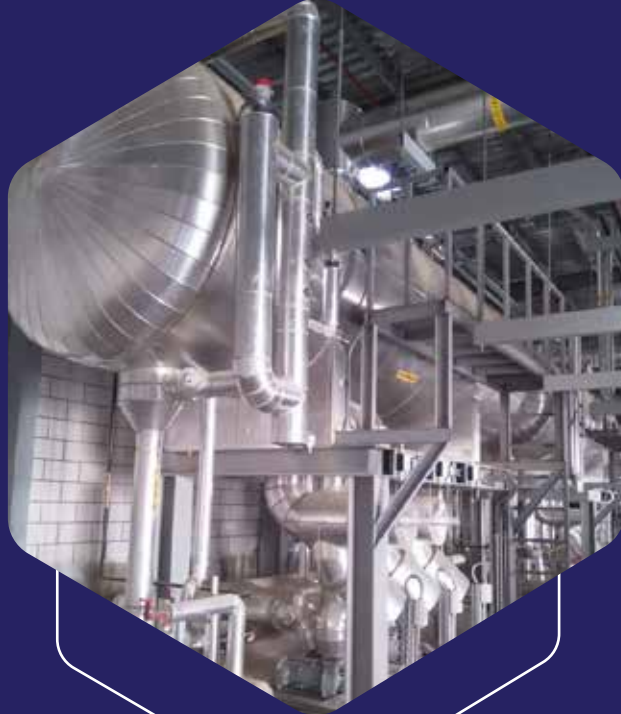
FIVE COMPRESSOR PARRALLEL RACK SYSTEM