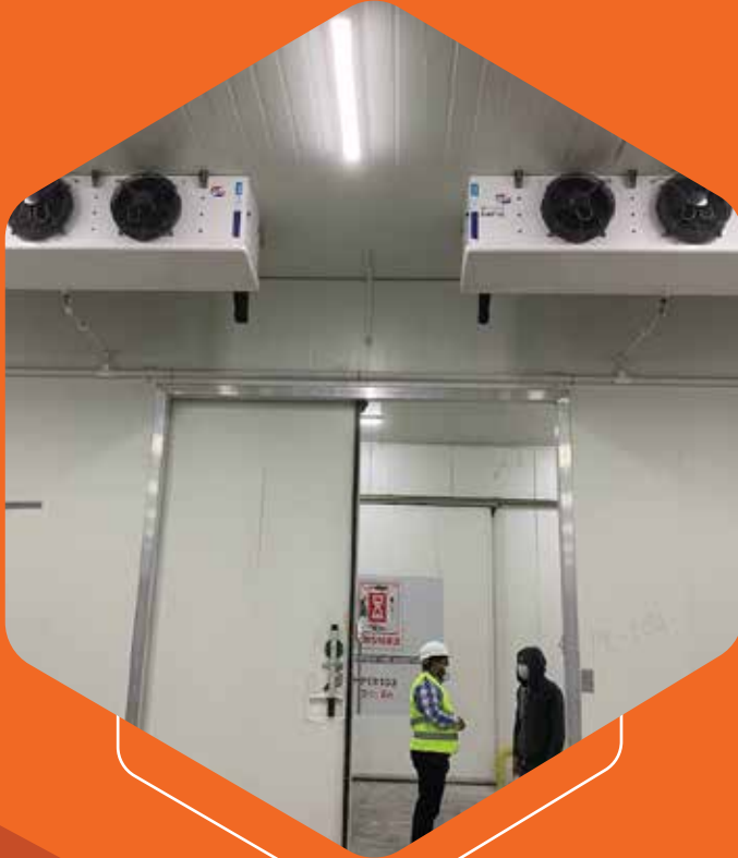
Refrigerated Cold Rooms ( Walk in Cold rooms) Hinged Doors